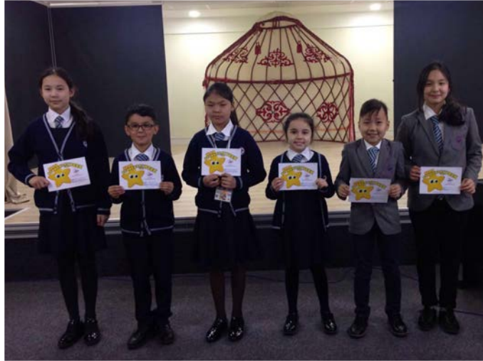
KS2 Assembly. Students of the week.