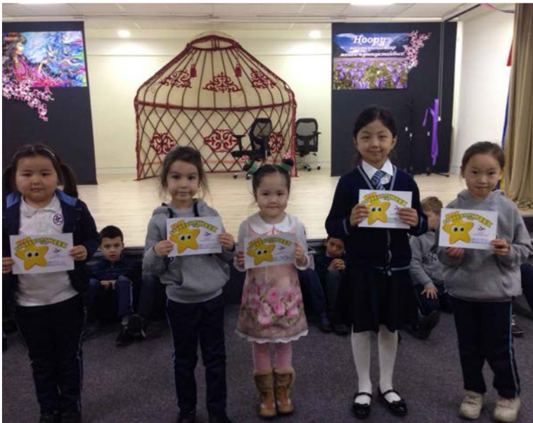
KS1 Star Students ID the week