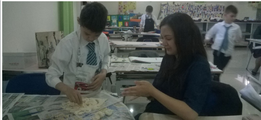
PARENTS ARE ATTENDING AN ART WORKSHOP DURING ART WEEK.