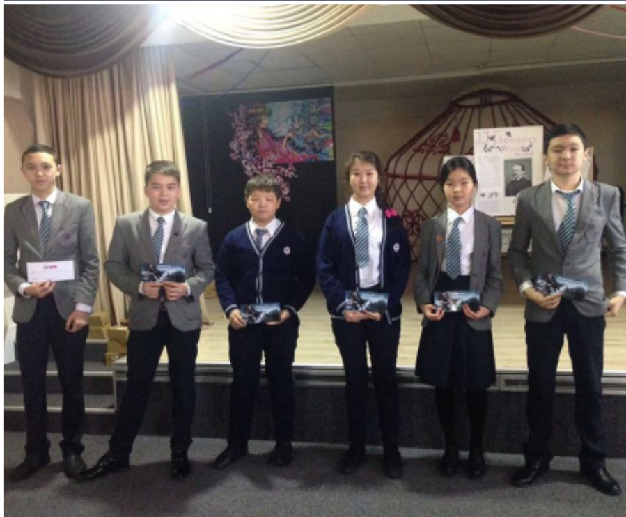
KS3 students of the week