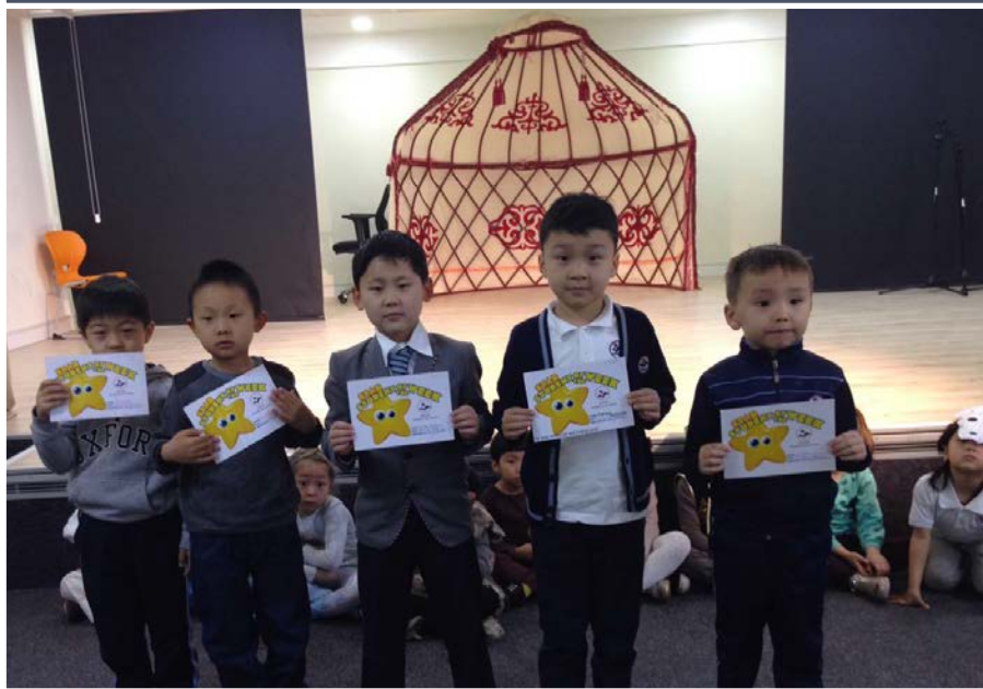
KS1 Star of the Week